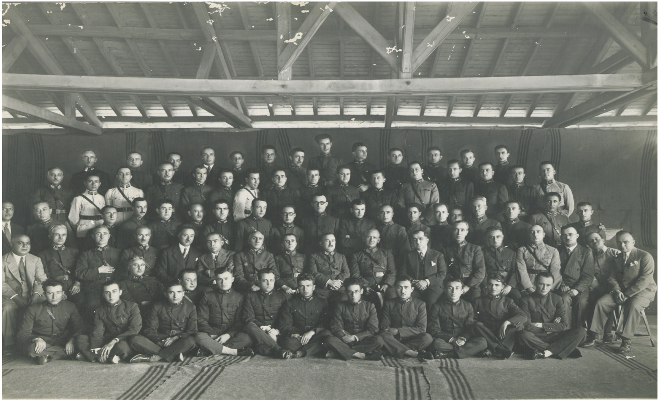
Graduates of the Faculty of Medicine on June 18, 1930 and the alumni names on the back of the photo