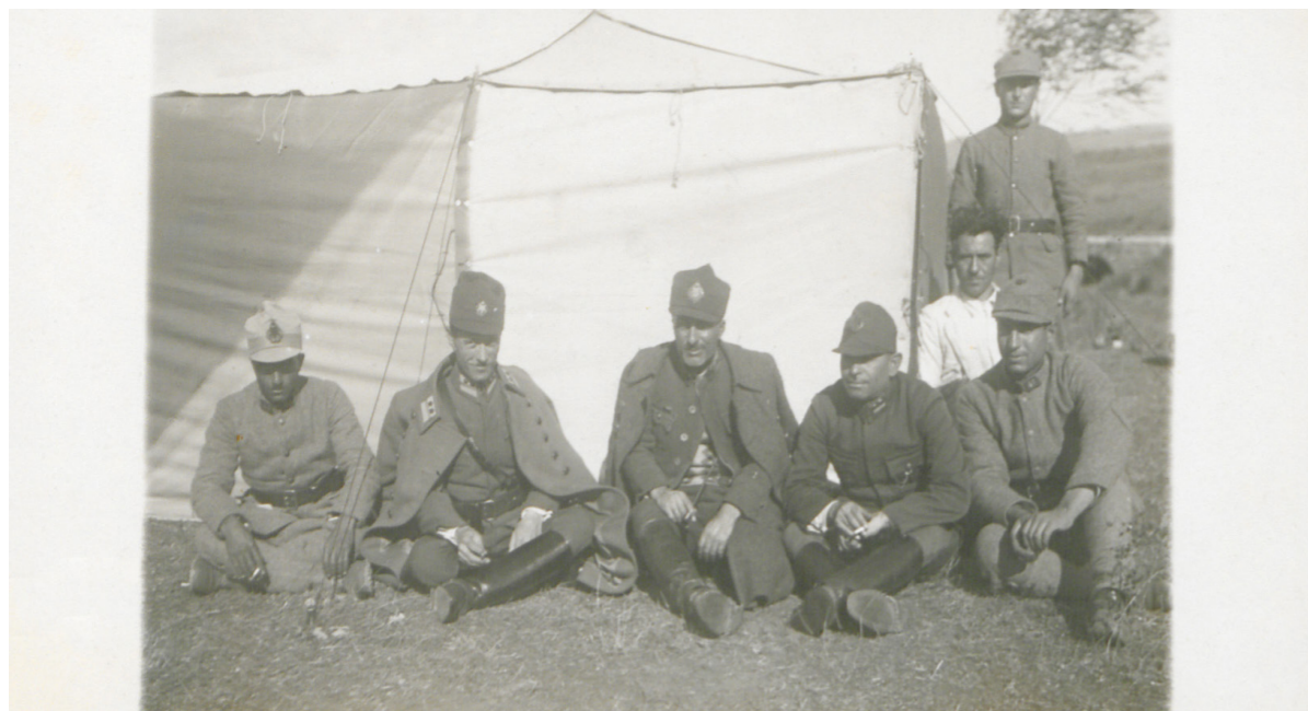
4th Regiment maneuver, 1931

The majority of the archival documents in the collection is in Ottoman Turkish (based on the Arabic Script) as well as a small portion of documents in Turkish (based on the Latin Script). In the scope of the project archival documents in Ottoman were transcribed with the help of professional academic advisors and translated to English with an academic translator whom specialist on the field. All descriptions and metadata have been prepared in bilingual, Turkish and English