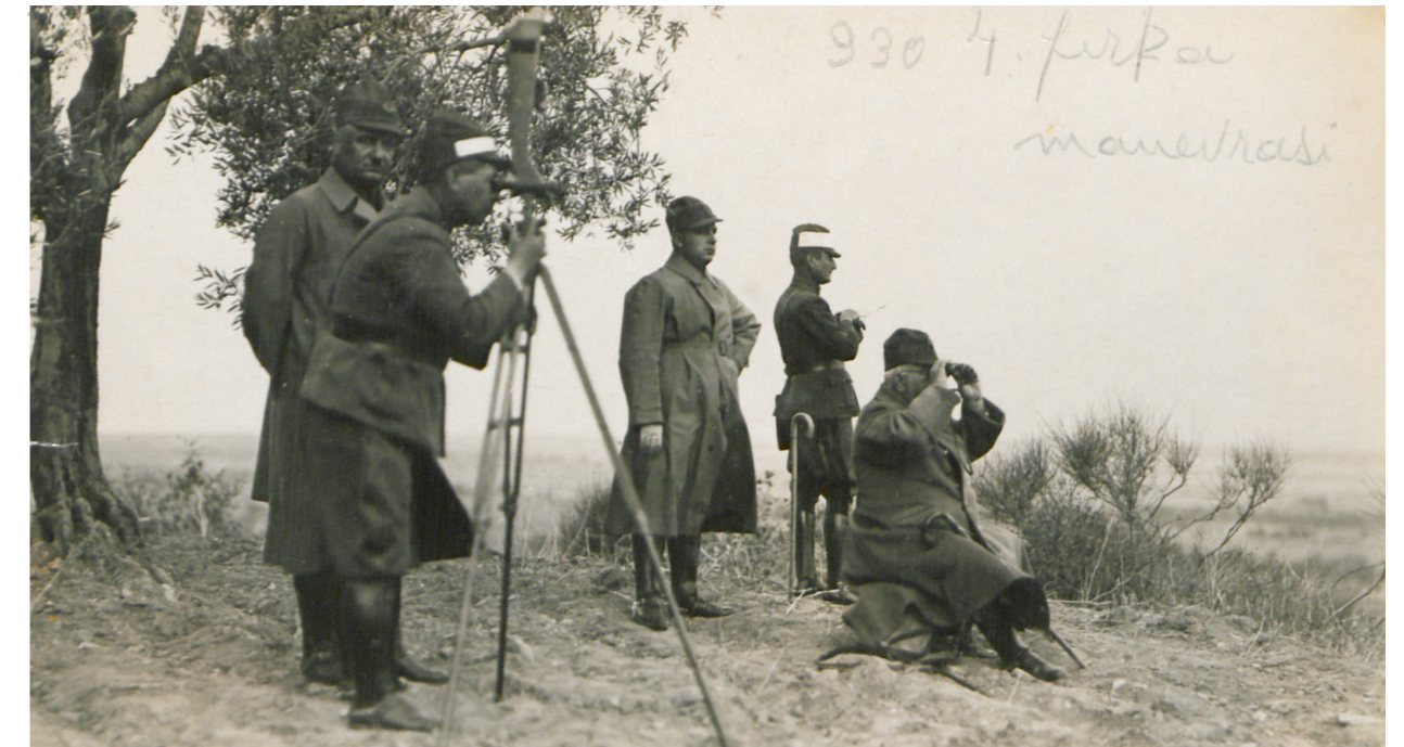
4th Division maneuver, 1930

The metadata fields of the collection are created in both Turkish and English as follows: